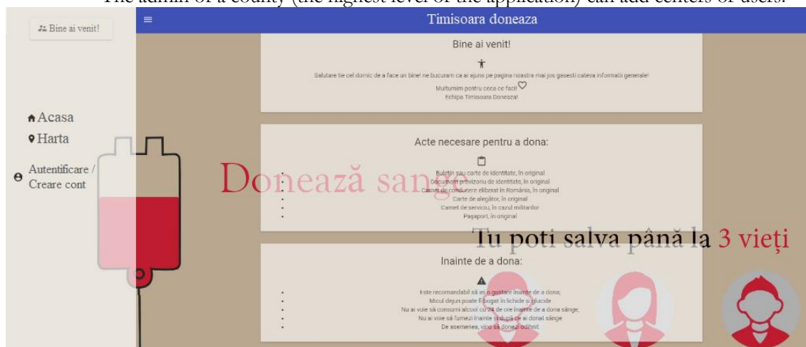
Figure 2. The home page allows the access on five levels.

The application was implemented for Timisoara and its resident citizens. For this reason, the interface is provided in Romanian. If necessary, it can be translated.