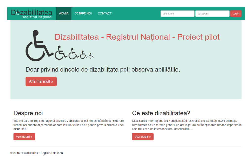
Figure 1. Section 1 of the application for disability evaluation

• Section 1 : looks like a web site that will contain some informational material on disability as well as useful instructions for the persons bearing the burden of disability (Figure 1).