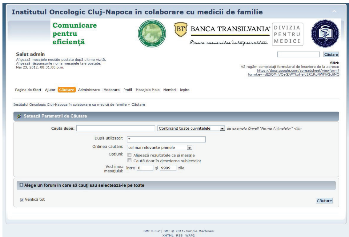
Figure 5. The search engine of the forum “IOCN in collaboration with family physicians”